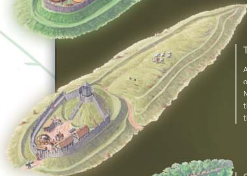
The Motte (1200) A motte and bailey castle was later built on the site of the hillfort, probably by the Normans. The motte is still evident; it is the prominent mound on the summit of the hill.