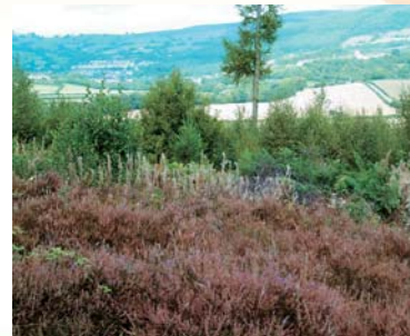
As well as native woodland, heathland and grasslands are being created to help other species of wildlife thrive.

Today, you can enjoy the same scenery, much changed over the centuries as people have adapted it to the needs of their times. By enjoying it responsibly, you can help Ruperra Conservation Trust keep this as a sanctuary for people and wildlife alike.