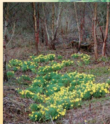
Wild daffodils provide a glorious display in springtime.