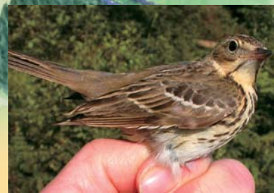
A volunteer team from the British Trust for Ornithology are recording the birds which use the site, including Tree Pipits which are becoming increasingly rare.