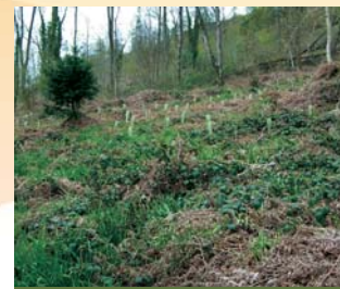
Ancient woodland once covered these slopes. Now, new planting of native trees is helping to restore the wildlife value.