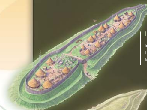
Iron Age hillfort (200BC) In the Iron Age, a mighty fort crowned the hilltop, dominating the landscape for miles around.