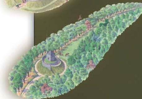
Summerhouse (1700) We know from archaeological remains that people lived on the motte and made the most of the views in mediaeval times. Mention is made of Cadwgan in the 15th century "who built and died in the tower long called after him at Rhiwperra". From an Estate map we know that in the later 17th century a two storey stone summerhouse was built there. Finally, at the beginning of the 20th century, there was a split log, thatched summerhouse there, which people living today can remember.